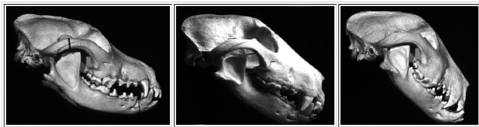
Changes in the shape of the Bull Terrier head, 1930, 1950, 1980

The pictures above are a physical and visible monument to what the show ring did to one terrier breed in less than 50 years time.